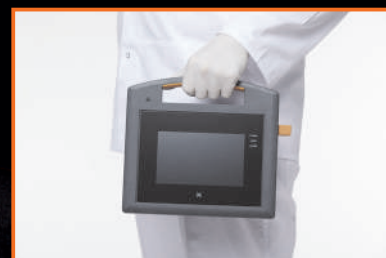
FUNCTIONALITY AND COMFORT