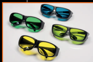
SAFE FOR DOCTOR AND PATIENT