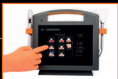
EVERYTHING AT A GLANCE