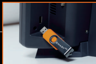
DATABASE, MANUAL AND SAFETY KEY IN ONE